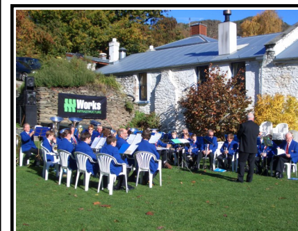
Ascot Park Hotel Auxiliary Band playing at the Arrowtown Autumn Festival

249 Spey Street, Invercargill PO Box 536