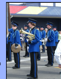
At the Alexandra Blossom Festival