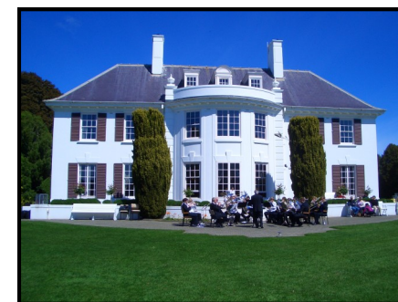
Ascot Park Hotel Brass entertaining at Andersons Park