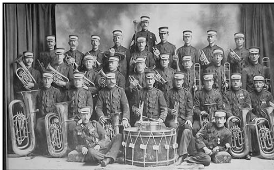
Invercargill Garrison Band, 1909.

A complete list of committee members is available in the Band room.