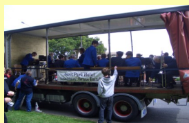
Preparing to play in the Summer Festival Parade

Duties : Rosters for supper duties and cleaning of the Band rooms. (Occur once or twice a year.)